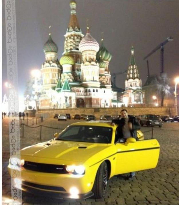
In a photo used by prosecutors in his federal trial, Roman Seleznev poses with a 1 of 3 Dodge Charger in Moscow.

Originally published April 21, 2017 at 10:19 am | Updated April 21, 2017 at 12:38 pm